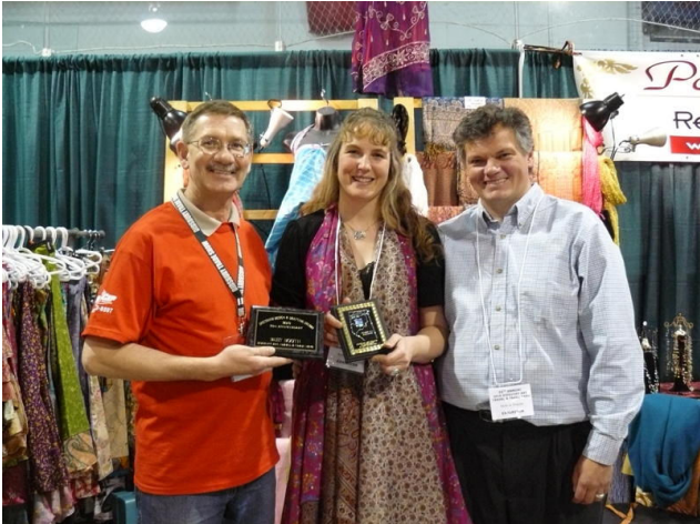
1st Place Best Booth Ports of Pogoda