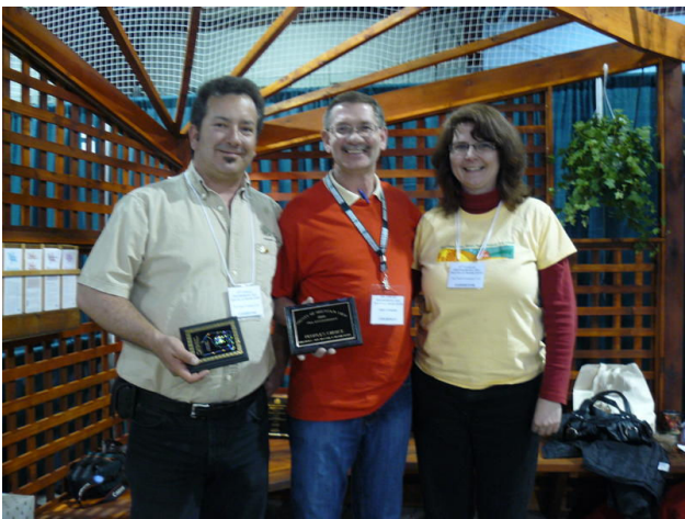
People's Choice For Trees Company Ltd

Mission Statement The Didsbury & District Chamber of Commerce is a community-based volunteer business organization, whose purpose is to support, promote, nurture, and educate for the improvement of our business community