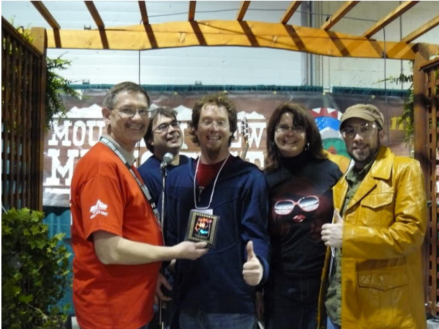
2nd Place Best Booth Fellowship of the Mountain View Music Festival