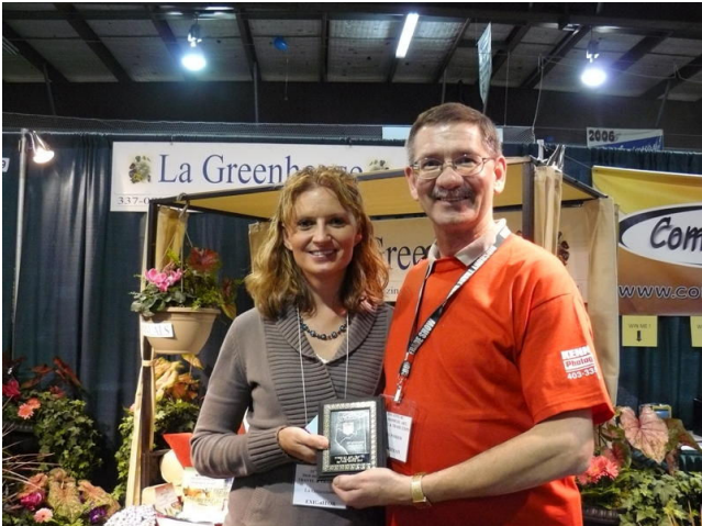
3rd Place Best Booth La Greenhouse